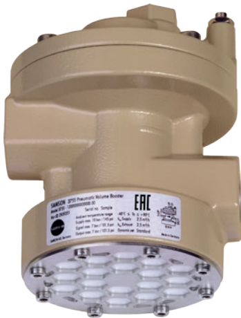
Type 3755-1: low-noise venting over a sintered polyethylene filter disk