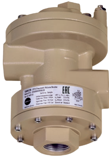
Type 3755-2: flanged-on threaded exhaust port